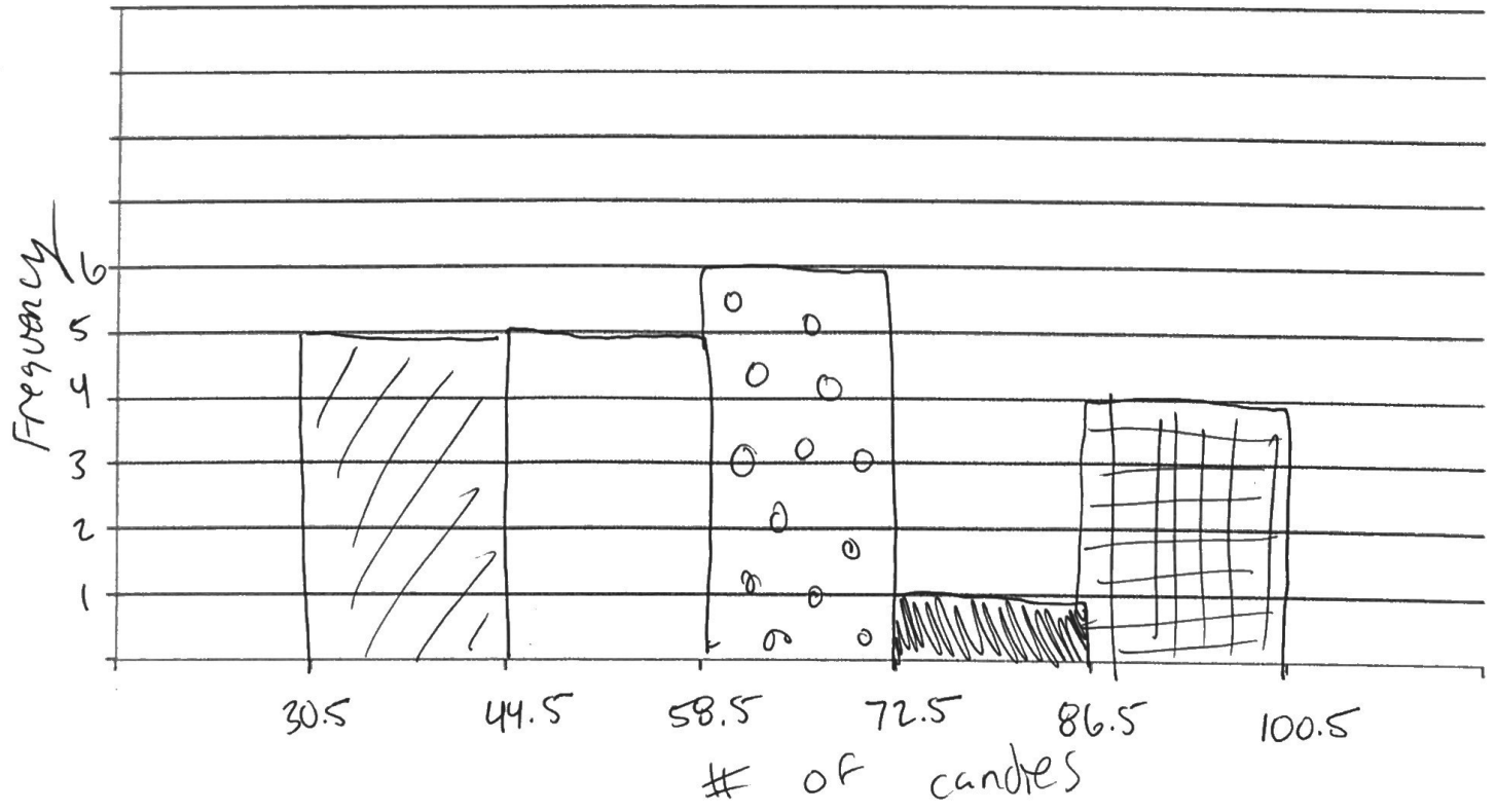
Chocolate Candies Per Bag of Trail Mix